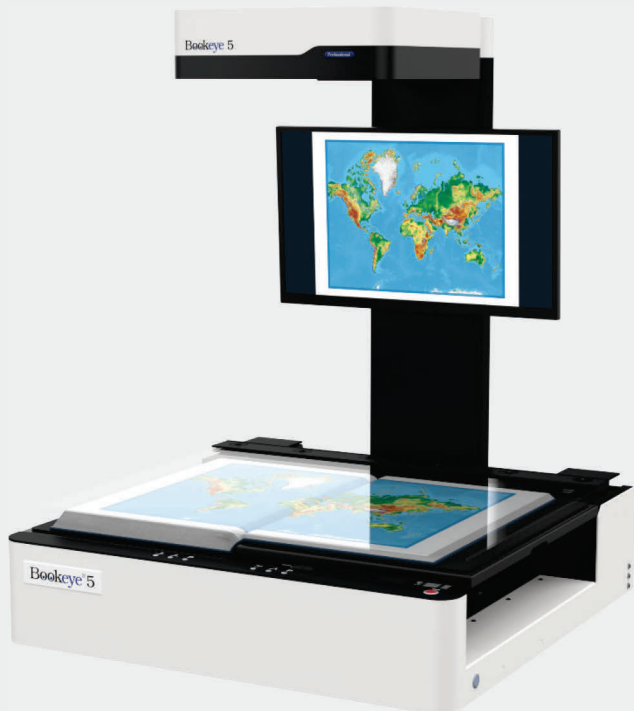
The Bookeye® 5 V1A with V-shaped book cradle and motorized glass plate

Before a new book is scanned, the lift motor lowers the glass plate onto the book until the desired pressure is reached. The pressure is measured highly accurately, and it can be up to 10kg / 22lbs under operator control. Once the book's thickness is programmed into the lift mechanics, the scanner only needs to open and close the scanning glass to allow for book page flipping. The borderless glass plate opens automatically after each scan to the user defined angle. The speed at which the glass plate opens and closes is also user adjustable.